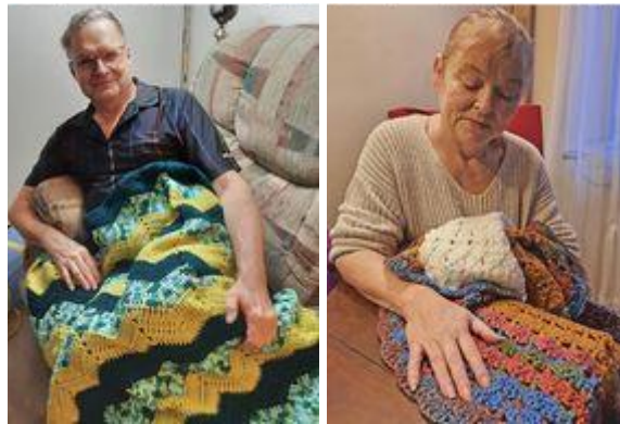
Exeter One Care -

People Care Oak Crossing - blankets were given as gifts opened by residents on Christmas Day